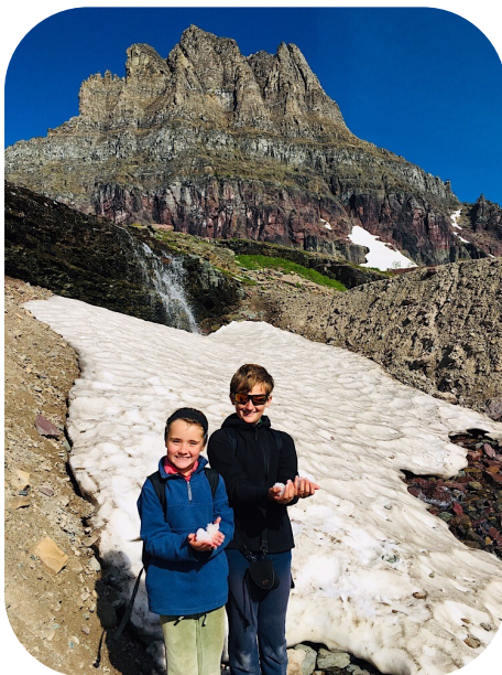
Two Broome kids experiencing their first snow at Glacier NP, Montana, USA