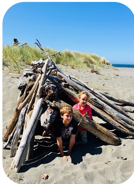
Building driftwood huts on the beach in Oregon, USA.