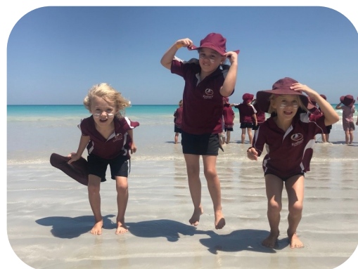
Pre Primary Cable Beach Excursion